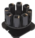
Automatic eight cell holder