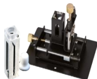
Adjustable XY micro cell holder