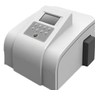
Sipper flow system / Sipper flow system with Peltier