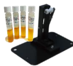
Test tube holder