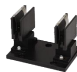
Long-path cell holder (For double beam system)