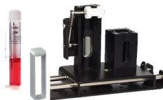
Multi-purpose cell holder